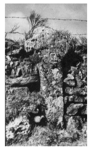
Fig. 5 Peverall's Cross

medieval stone cross not only marks the boundary of the two manors, but also the two parishes of Blisland and Cardinham, and it is also a wayside cross marking the highway. Of the remainder of the boundary stones that mark the western strip of land at Trehudreth all but two carry the mark of either Morshead ( M^{\uparrow}P ) or Hayward (HP).<sup>7</sup> However, two stones that stand midway along this strip of land both also display MX for the Manor of Blisland. A map indicating the layout and orientation of the stones on this strip of land at Trehudreth Downs is shown in fig. 6.