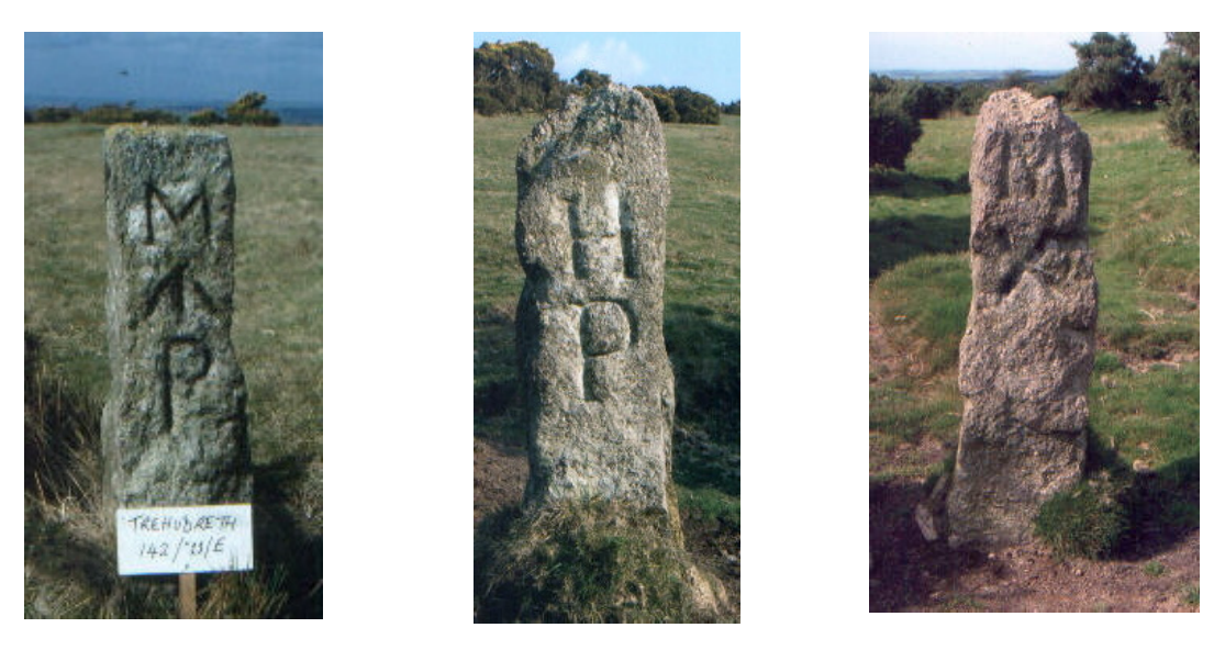
Figs. 2,3 and 4 Shows boundary stones with the marks of the Morshead family, James Hayward and the Manor of Blisland.

To the far south-east corner of Trehudreth and stretching onto Greenbarrow Downs is another medieval earth bank that marks the parish boundary between Blisland and Cardinham. This boundary continues along to the main road and then continues along the southern end of Greenbarrow between the modern A.30 and the road to Temple village (old A30). Boundary stones mark this parish boundary, although only one exists on Trehudreth Downs: no. 142/12.